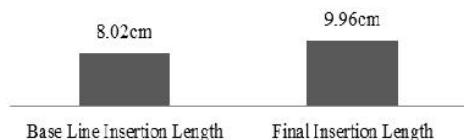
Fig. 2 Results with dilator on vaginal patency