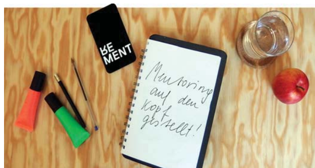
Fig. 2 Reverse-mentoring postcard; German text: "Mentoring turned on its head!"

Besides the organisational issues, one main task of program managers is the promotion of the mentoring program inside and outside school. This can be through the use of flyers, as shown in Fig. 2, presentations for the colleagues and in class, articles for newsletters and blogs or texts in newspapers. Also the official events of the program, the kick-off and the closing event (see below), can be used for the promotion of the reverse-mentoring program.