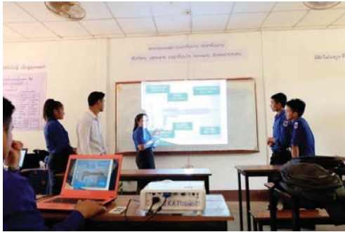
Fig. 2 Presentation of class experiments

We advised about the treat for numerical values for measurements because some groups showed long decimal numbers or the order of the numbers.