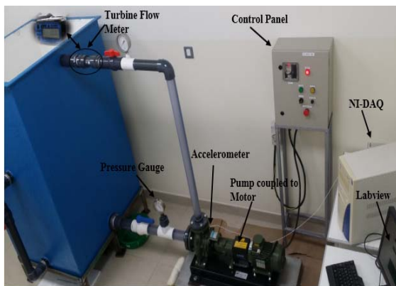
Fig. 1 Experimental setup

The centrifugal pump experiment has been designed and assembled specifically for this research where it consists of parts including: centrifugal pump which is coupled with a motor (Saer company, Italy, model: NCBZ-2P-50-125C, 2.2 kW, 3-phase, 420 V, head 8-17 m and flow rate 500-1000 L/M), control panel with speed controller (Schneider model VFD with speed controller and display screen, switch (OFF/ON) and emergency shutdown), digital turbine flow meter (USA-TM model, 2 inch diameter), pressure gauges, vacuum pump and clear PVC pipes; and spare parts: a rolling element bearing, mechanical seal, gasket and impeller. A data acquisition system (DAQ) and accelerometers from National Instruments (NI) are used. The DAQ system comprises SCXI-1000 and SCXI-1530 models. The accelerometer model is IMI 621B40 with sensitivity of 10 mv/g and frequency range from 3.4 to 18000 Hz for ( \pm 10\% ) and 1.6 to 30000 Hz for ( \pm 3 dB). Fig. 1 shows the centrifugal pump experimental setup which includes the products of NI.