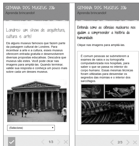
Fig. 5 Interactive activities for mobiles