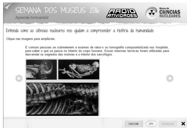
Fig. 4 X-rayed mummies at the British Museum

Moreover, the entire project is designed to guarantee a user-friendly and functional system with great performance on mobile devices, as seen in Fig. 5.