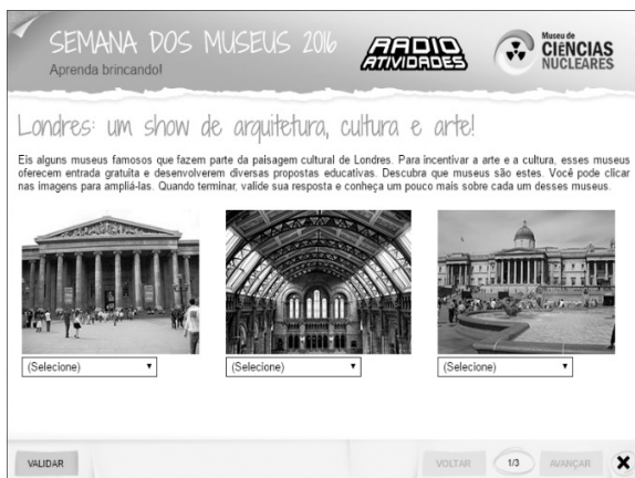
Fig. 3 Discovering some famous museums in London

The interactive activities were developed combining several technologies, such as PHP, MYSQL and HTML 5. PHP and MYSQL are two of the most popular Open Source scripting languages. HTML5 is essential to design and develop high quality animations that load quickly and look great.