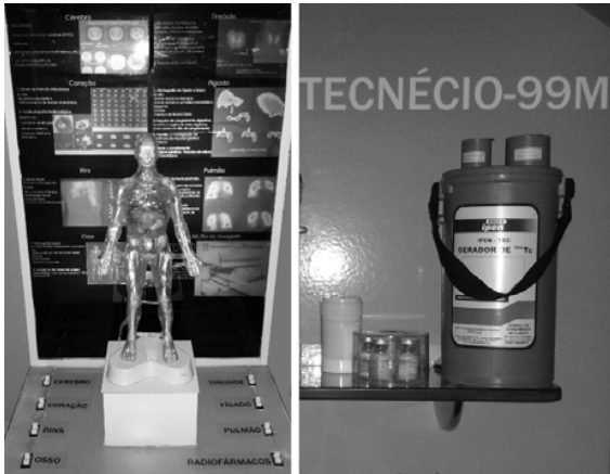
Fig. 2 Interactive panel and material used to explain nuclear medicine

Expanding its array of activities far beyond the geographic frontiers of the museum in order to build new bridges between nuclear science and society, the museum team promotes public exhibitions in shopping centers, as well as summer courses. The Summer Course is a programme of the Brazilian National Network of Education and Science to enhance science education throughout Brazil. In a one-week-course, participants experience new approaches to teach and learn science. In January 2015, 17 teachers attended the training course "Playing with the atom", offered by the Nuclear Science Museum [1].