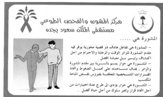
Fig. 7 Arabic-English Translation for HIV/AIDS brochure from KSA Ministry of Health containing basic information about HIV/AIDS distributed in 2008

From Fig. 7, Center for Voluntary Counseling and Testing Counseling is: