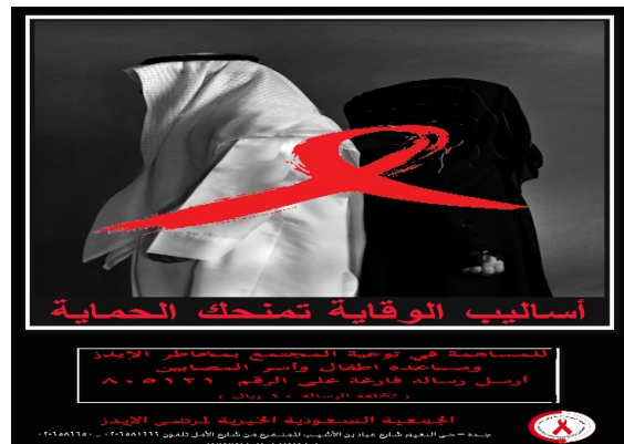
Fig. 6 Arabic-English Translation for HIV/AIDS brochure from Saudi Charity Association for AIDS Patients distributed in 2014

Protection from HIV infection is in your hands as shown in Fig. 6.