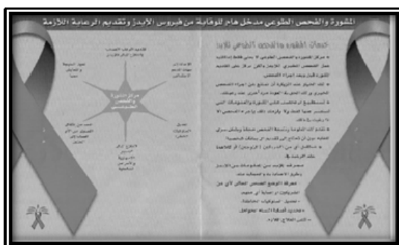
Fig. 2 Arabic HIV/AIDS brochure from King Saud Hospital containing information about counseling - distributed in 2008

Arabic-English Translation for HIV/AIDS brochure from King Saud Hospital containing information about counseling - distributed in 2008.