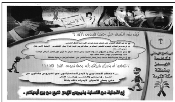
Fig. 5 Arabic HIV/AIDS brochure from KSA Ministry of Health containing basic information about HIV/AIDS distributed in 2008

Protection from HIV infection is in your hands as shown in Fig. 6.