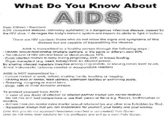
Fig. 9 Brochure from Saddiqa Maternity & Children Hospital containing basic information about AIDS transmission-translated by hospital distributed in 2008