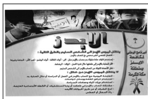
Fig. 4 Arabic HIV/AIDS brochure from KSA Ministry of Health containing basic information about HIV/AIDS distributed in 2008

Arabic-English Translation for HIV/AIDS brochure from KSA Ministry of Health containing basic information about HIV/AIDS distributed in 2008.