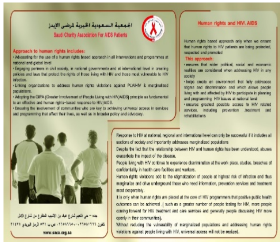
Fig. 11 (b) English HIV/AIDS brochure from Saudi Charity Association for Health Care Providers distributed in 2014