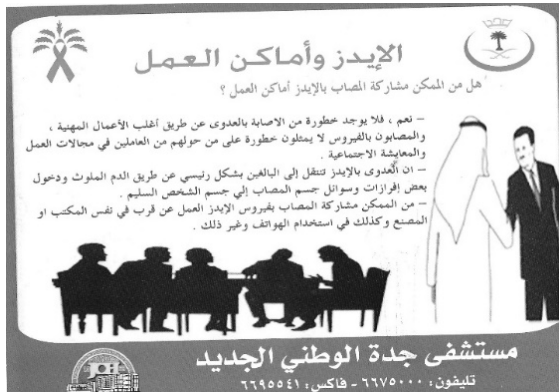
Fig. 8 Brochure from New Jeddah Clinic Hospital about AIDS in the Workplace