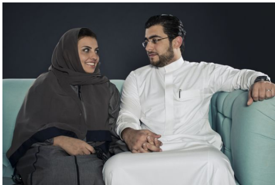
Fig. 1 Example of Support

How can you support your loved one with HIV/AIDS?