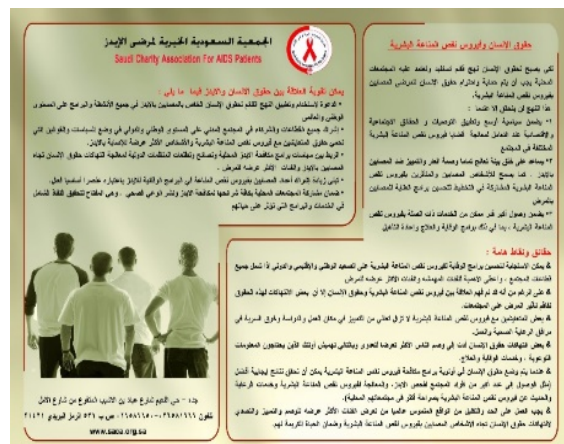
Fig. 11 (a) Arabic HIV/AIDS brochure from Saudi Charity Association for Health Care Providers distributed in 2014

Arabic-English Translation for HIV/AIDS brochure from Saudi Charity Association for Health Care Providers distributed in 2014.