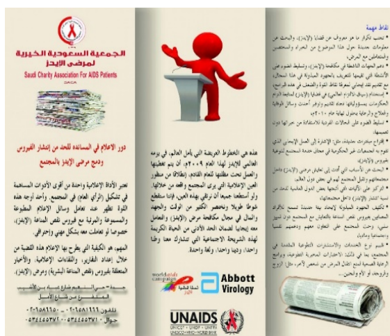
Fig. 12 Arabic for HIV/AIDS brochure from Saudi Charity Association for Media Producer -distributed in 2014

Arabic-English Translation for HIV/AIDS brochure from Saudi Charity Association for Media Producer -distributed in 2014.