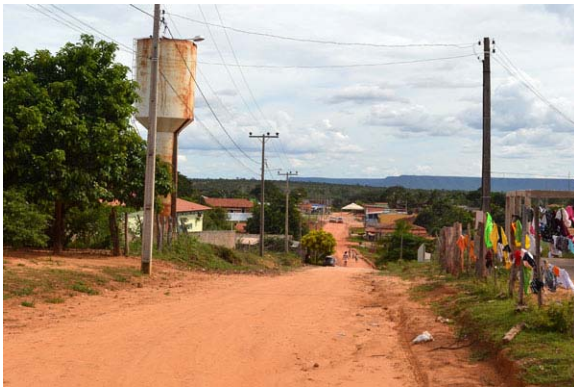
Fig. 7 Streets of Mateiros

referred to the water supply, public cleaning services, public security, banking services and tourism signage.