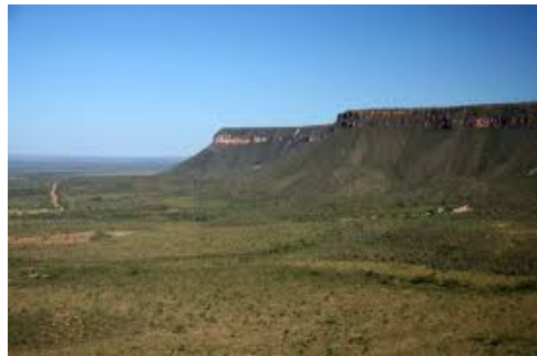
Fig. 2 Serra do Espírito Santo