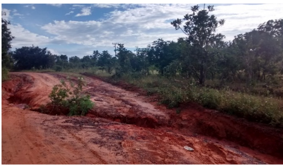
Fig. 8 Access road to the city of Mateiros

As for the water supply, respondents reported that there is a constant lack of available water in Mateiros; a problem is exacerbated during the tourism season, when the demand for water by stakeholders in the tourism sector increases.