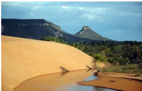
Fig. 1 The Dunes

Among the towns that make up the Jalapão, Mateiros (9,681,657 km 2 ; 2,223 inhabitants) is one that profits most from the tourism flow in the region [3]. It is in a privileged location in relation to the others. It is also the town that is nearest to the park attractions; thus, it is the main center for receiving tourists and where tourists tend to stay longer during the seasons.