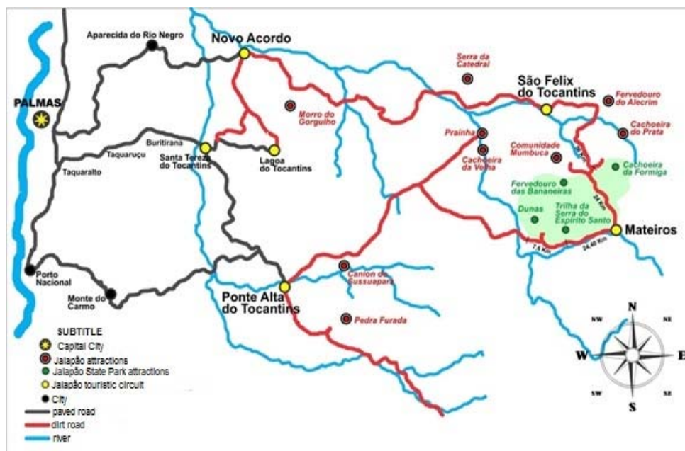
Fig. 5 Localization map of the Parque Estadual do Jalapão [7]

that support the community when developing the activities at the site.