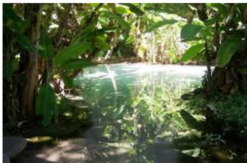
Fig. 3 Fervedouro das Bananeiras