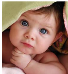
Fig. 3 Secret Image