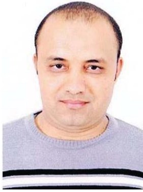
Fig. 4 Stegano Image

(secret image) from cover image and transmit to PC. We need new powerful Steganalysis techniques that can detect messages without prior knowledge of the hiding algorithm (blind detection). The detection of very small messages is also a significant problem. Finally, we need adaptive techniques that do not involve complex training stages. The comparison between the LSB method and the proposed method using experimental results demonstrate that our original and optimal proposed method keeps distortion low and uses a low memory capacity and a less execution time due to the reduced number of needed bytes, 5 against 8 in conventional LSB technique.