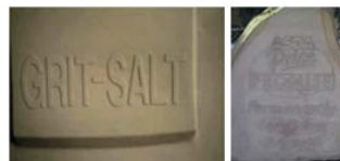
Fig. 3 Failed examples of character detection and recognition in natural scenes

It is also worth mentioning that Deep Learning in neural networks seems to be powerful for many pattern recognition issues, including character recognition. Unfortunately, it is not the case in our numismatic context where we consider also rare coins for which we have few representative data for training.