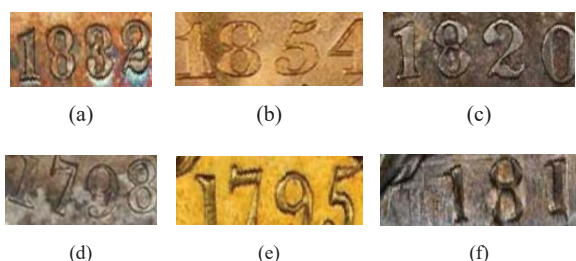
Fig. 5 Samples of extracted date zones

The extracted date is then cropped into four individual numbers to recognize. The crop is simply proceeded by searching the “valleys” of the histogram H(w_{date}) which are closest to the supposed separations (25%, 50%, and 75% of the width of w_{date} ). For individual cropped number images, we could have imperfect but workable samples including slightly skewed numbers (Fig. 4 (f)), partially incomplete numbers (Fig. 4 (e)), and numbers with other salient pattern in their bounding box. In the following section, we will propose a recognition method dealing well with those noised data. The cropped numbers remain in binary gradient map and normalized into the size for recognition. Fig. 6 demonstrates the whole process of date extraction.