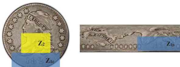
Fig. 4 Candidate zones for date retrieval

Date extraction is carried out by searching the possible date zone in the coin photo. Even though a date could appear at any position of each side of the coin, in most cases its position is relatively limited especially when we know some a priori knowledge such as the country of the given coin. We could also consider that a pre-selection as been done using [2] for example. Therefore, a list of candidate zones is proposed in order to reduce the searching time over the entire image. According to our observations on more than 3000 modern American coins, the bottom of the obverses and the middle of the reverses have the most chance to contain the date. As sometimes the date on the bottom runs in a circular way inside the coin border, a polar coordinates transform is used to put the circular date in a horizontal way. Thus, if we have no idea which side of the coins is in the image, the candidate zones are defined at the bottom part by Z_{1c} and Z_{1p} and, in the middle part by Z_2 . Let us denote by Z = \{z_{1c}, z_{1p}, z_2\} the set of candidate zones (see Fig. 4).