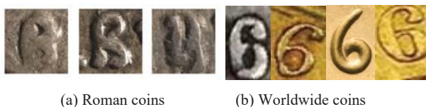
Fig. 2 Variations of appearances on cropped character patches

As mentioned before, characters of coins have totally different properties from those in traditional fields of character recognition. Therefore, in the previous study on ancient coins, detection of coin legends is considered as a particular object recognition task rather than conventional character recognition. Arandjelovic [14] described the character appearance by using a HoG-like descriptor, but this step is implemented in the whole coin recognition pipeline and he did not report individually his character recognition results. Zambanini and Kampel [1] and Kavelar et al. [15] used a single SIFT descriptor to describe the patch which contains the character and they reported a recognition rate of 25% to 68% according to different training size per class (15 to 50). Both their methods require off-line training so it is only applicable when sufficient and representative training data are available. In addition, their studies on Roman coins cannot be easily extended to worldwide modern coins with the same size of training data due to variations of fonts and patch appearances (see Fig. 2).