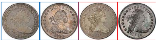
Fig. 1 Release period differentiates similar monetary types. DrapDolSE_rev (blue): 1795-1798; DrapDoILE_rev (red): 1798-1803