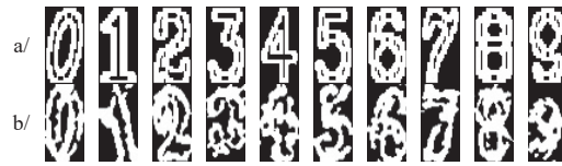
Fig. 9 Samples in two datasets (a/ synNum , b/ coinNum )