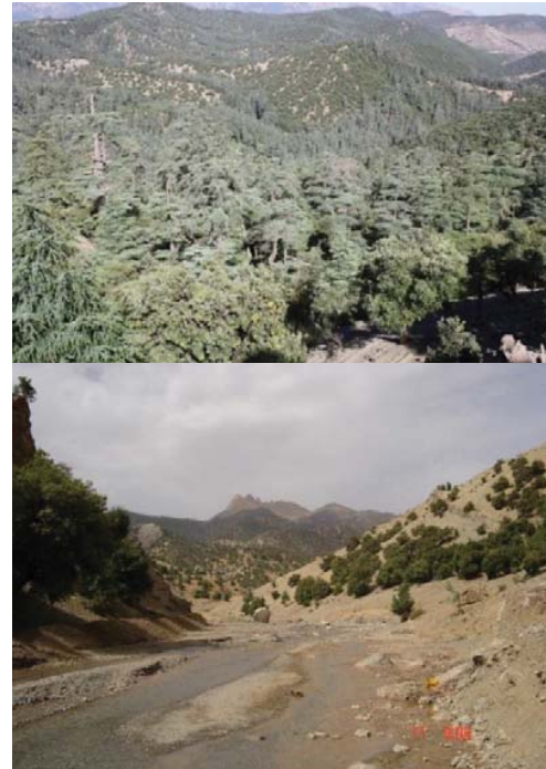
Fig. 1 General view of forest ecosystems in Morocco

The methodology is mainly based on a literature review of principal theses and projects for the conservation of flora and vegetation.