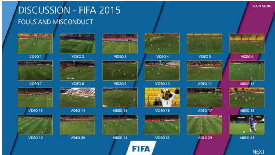
Fig. 5 Example of a multimedia presentation