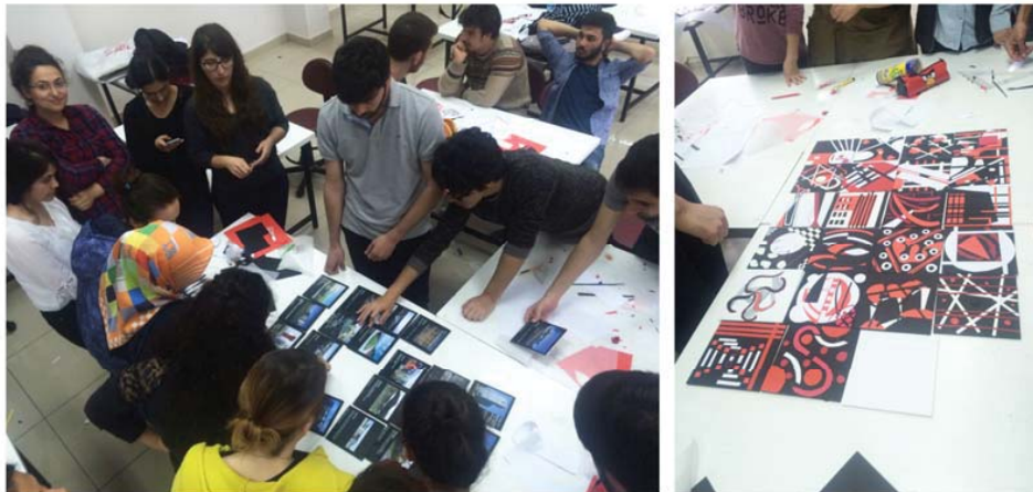
Fig. 7 Formal Resemblance holistic pattern of Toyo Ito's buildings/architecture (© Serap Durmus)