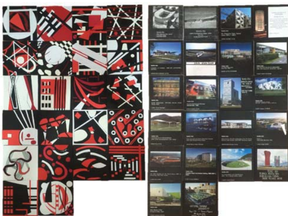
Fig. 8 Chronological holistic pattern of Toyo Ito's buildings and formal/conceptual representations