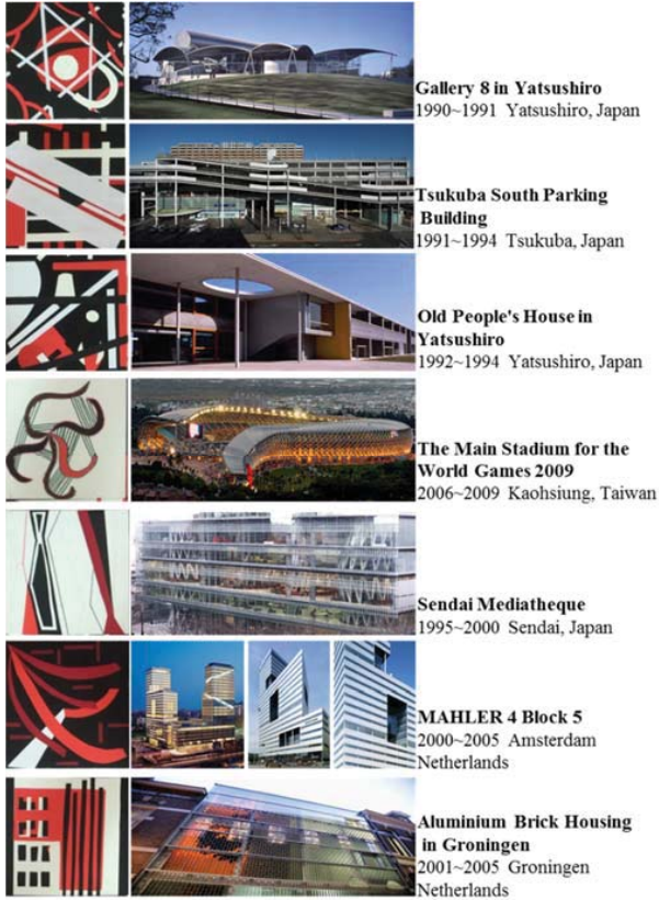
Fig. 10 Common buildings and representations in Chronological and Formal Resemblance

therefore their graphical representations, were found to maintain their positions in both formal resemblance and chronological placement patterns (Fig. 10). In this context, seven buildings –four in Japan, one in Taiwan, and two in the Netherlands– and representations thereof took the center stage.