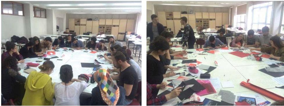
Fig. 5 First studies for workshop (© Serap Durmus)

In the second step , the students were asked to depict the section, part, or color of their sketches they deem the most prominent, on a square workspace of 15 x 15 cm, using fund cardboards. In the third step , the students were requested to remove their sketches from the table. Then, a circle was developed whereby each student delivered his or her work to the third student to his/her right. Students who face a new Toyo Ito building were, thus, made accustomed to new works, thanks to the concepts they heard from their friends, as well as the images drawn on the back of the styrofoam. The students who were expected to implement the second part of the work made additions by introducing their own interpretations/ perceptions regarding the structure, as they would be unable to remember the exact sketch. This intervention took place in an air dominated by the excitement and wonder imposed by the method.