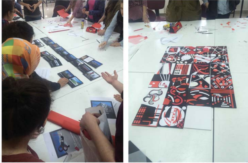
Fig. 6 Chronological holistic pattern of Toyo Ito's buildings/architecture