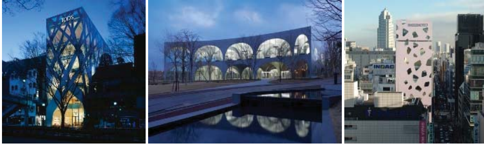
Fig. 2 Tod's Omotesando building, Toyo Ito, 2004; Tama Art University Library in Tokyo, Toyo Ito, 2007; Mikimoto building in Ginza, Toyo Ito, 2005 [21]

Instead of using modern concepts to explain away the modern world, Toyo Ito built a brand new conceptual world. Ito's architecture, particularly its examples in the contemporary Japanese metropolis, is often considered a form of "clothing" for the urbanites. This theme revolves around a balance between one's private life and public life. According to Ito's philosophy of architecture, the surface, as the element of design, itself is the material, face, and structure all at once. Such an analysis leads to a planning beyond further dismembering where everything is an element of the whole, rather than one based on a distinction between interiors and exteriors (Fig. 2)