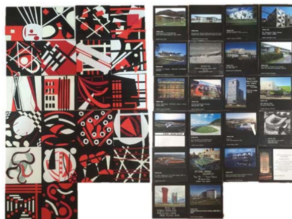
Fig. 9 Formal Resemblance holistic pattern of Toyo Ito's buildings and formal/conceptual representations (© Serap Durmus) In conclusion of the comparison, the buildings below, and