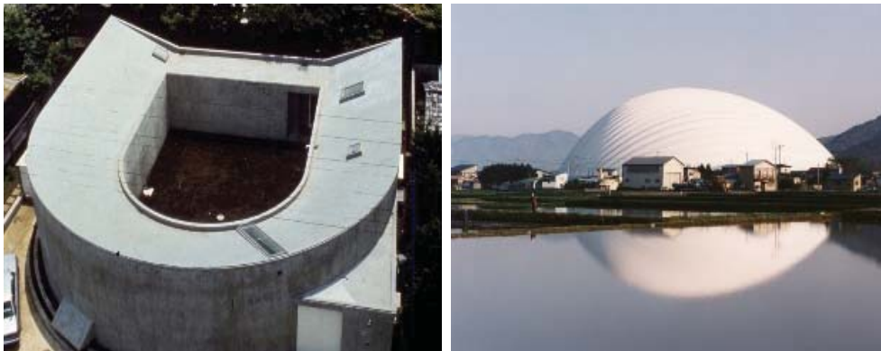
Fig. 3 White U house in Tokyo, Toyo Ito, 1975-1976; Dome in Toyo Ito, 1993-1997 [21]

In line with the technological developments experienced in the field of design and architecture, Toyo Ito's works can be categorized in two groups: pre-digital and post-digital works. The pre-digital projects focus on analytical calculations and well-defined geometric forms. One can observe an emphasis on more organic lines instead of the conventional rigid rectangular boxes (Fig. 3). His post-digital works, on the other hand, is characterized by a design philosophy serving fluidity, transparency, and temporality, seeking to think of what had been left un-thought.