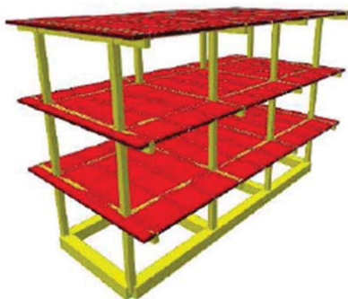
Fig. 1 Structural model used for analysis

The structural model, corresponding to a reinforced concrete structure is described in [14]. The time history analyses have been performed using SAP2000 software [15]. The results of the time history analyses for the types of loadings are listed in Table I in terms of maximum relative displacements.