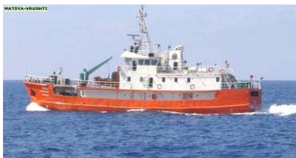
Fig. 1 Fishery survey tuna long liner

The tuna species were caught as shown in Fig. 2. The weight and length of all samples were recorded and finally gill, liver and flash samples, as it shown in Fig. 3, were taken for further analysis.