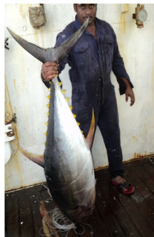
Fig. 2 Yellow fin tuna