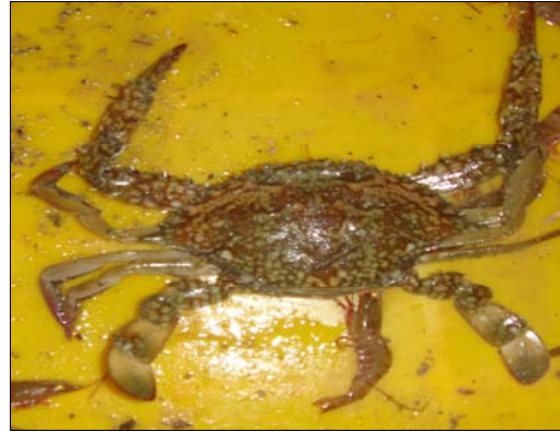
Fig. 12 Portunus pelagicus