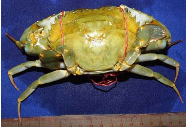
Fig. 13 Scylla serrata