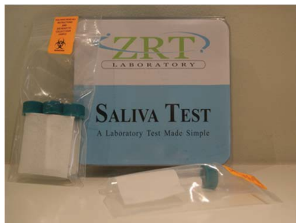
Fig. 1 Kit to test for cortisol in saliva

Saliva samples were collected at start and again after yawning response [Fig. 1], together with electromyography data of the jaw muscles to determine rest and yawning phases of neural activity [Fig. 2].