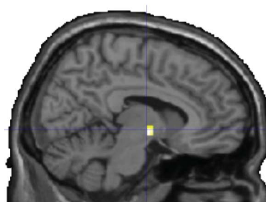
Fig. 4 Hypothalamus activity for mental task

In terms of cortical activity, the brain-stem and hypothalamus regions appear to be more active during the