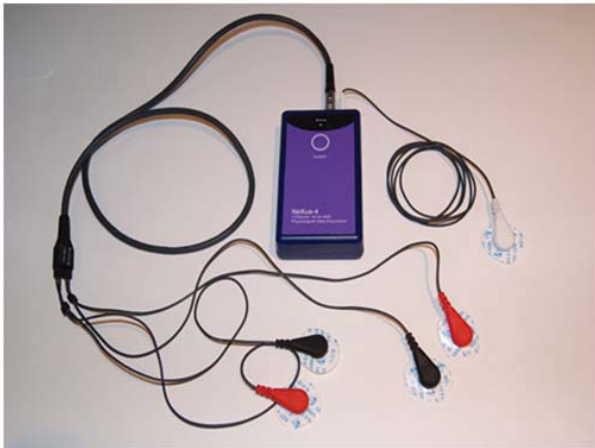
Fig. 2 Surface-placed electrodes to portable electromyograph

Exclusion criteria were: chronic fatigue, diabetes, fibromyalgia, heart condition, high blood pressure, hormone replacement therapy, multiples sclerosis, and stroke. Between- and within-subjects comparisons were made using t-tests and correlations using the SPSS package. This enabled a comparison to be made between yawner and non-yawner participants as well as between rest status and yawning episodes.