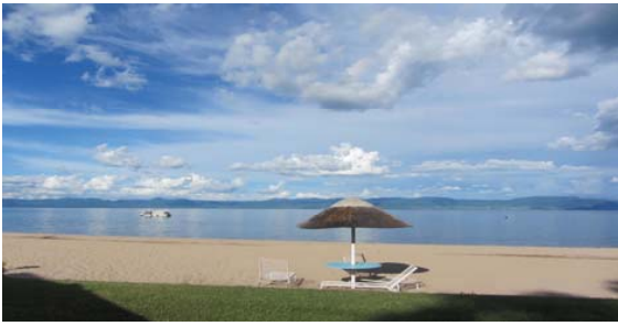
Fig. 1 Lake Malawi (Sunbird Nkopola Lodge, Author's photo, March 2013)

potential to attract international visitors in their own right.”