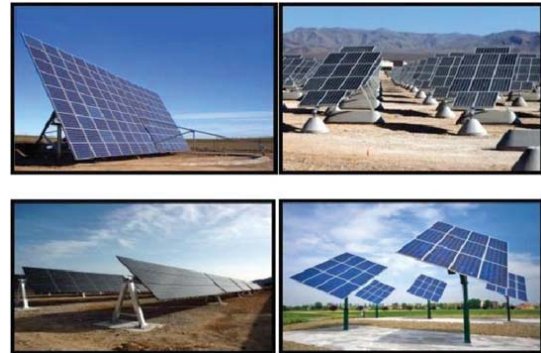
Fig. 1 Various Types of Solar Trackers

SOLAR energy is quickly gaining additional importance in increasing the renewable energy resources. This energy has the large risk of conversion into power. This paper is initiated to vanquish the loss in power generation on the solar battery. This may be done by succeeding the high intensity of the sunshine created by the sun rays. Solar battery is machine-controlled to follow the purpose of high intensity of the daylight victimization LDR (light dependent resistor) sensors. This sensing element helps to sense the extreme temperature created by the sunlight on the panel surface and it is sent to the microcontroller. This device sends the feedback to the servo motor that permits the servo motor to rotate the panel to receive the high intensity of the daylight. For this, we have to locate the exact position of the sun. This can be done using the Astronomical estimates from GPS. Furthermore, the tracker is kept under experiment for obtaining the readings on both the sunny and rainy days and the results are tabulated. By this strategy, it is doable to conserve the full quantity of power created by the panel by receiving the highest intensity sunlight. Fig. 1 shows the various types of solar trackers.