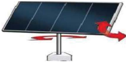
Fig. 2 Dual Axis Solar Tracker

Solar tracker may be a device that follows the movement of the sun because it rotates from the east to the west on a daily routine [5]. The solar systems need to supply one or 2 degrees of freedom in movement. Trackers keeps the solar panels orienting directly towards the sun because it moves through the sky each day. These solar trackers will increase the intensity of the solar power that is received by the solar power collector and improves the energy output of the heat/electricity that is generated. Solar trackers will increase the output of solar arrays by 20-30% that improves the political economy of the solar panel applications [6]. The two basic types of solar trackers are single-axis and double-axis. In this proposed system, we are using Dual axis tracking system. Dual axis tracker as shown in Fig. 2 has two degrees of freedom that act as axes of rotation.