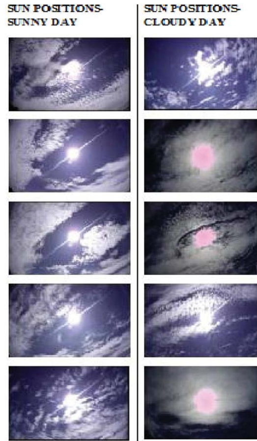
Fig. 3 Examples of sun positions during regular Time intervals in sunny and cloudy days

Using the tracking method that fuses astronomical estimates and the solar image, the solar tracker panel can maintain its position facing the normal direction of sunlight. However, when the weather is cloudy, controlling the tracker by solar image is not desirable because it is difficult to locate the sun using the solar image. In such a case, it is better to employ only astronomical estimates instead of their fusion with image processing.