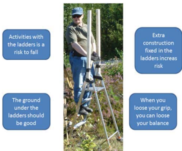
Fig. 2 Ladder work is risky