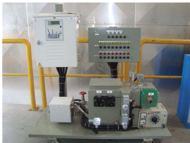
Fig. 3 Transformer Monitoring Test System

The knowledge level of the switch to read the information from TMS board level signal is provided on the resistance output module card (There are 10 Ω resistor at each level.). This situation simulates the resistance output module are mounted on the board. Step information on the movement of the shaft by inserting the shaft lever switch satisfies the card is intended to change the level.