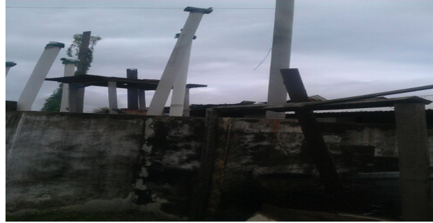
Fig. 6 Side view of the Burial pit

Landfilling was the most commonly practiced disposal method of healthcare waste at the three surveyed facilities. Burial pit was used for disposal of body parts that were generated from surgical procedures. The location of the burial pit is situated within a close proximity of the facility. In addition, the burial of other putrescible was done at the landfill situated in Whein town. However, it was found that incineration of waste was done under low temperature, which resulted in lapses as there was incomplete combustion of waste as well as inadequate disposal of the ash. This however poses threats to public health and the Environment. On the other hand, all health facilities dispose of waste along with domestic waste in an open dump site outside the city. These wastes were randomly mixed together and was then buried or incinerated. The public health Law of Liberia 1976, The Environmental Protection Law of Liberia, The Ministry of Health Division of Environmental and Occupational Health all have mandates to conduct sanitary inspection, evaluate compliance with the public health law on the management of medical waste, up till present there are no guidelines or standards on healthcare waste handling and management.