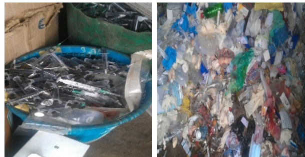
Fig. 1 Waste generated by facilities