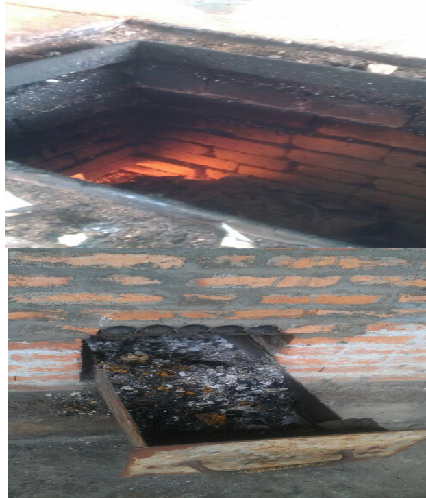
Fig. 4 Inside view of the Incinerator and ash produce after incineration

Incineration is one of the methods used to destroy pathogens from healthcare waste [14]. The three facilities surveyed had incinerators one of which was not functional. These incinerators were used for the combustion of waste generated from the facilities. Furthermore, they didn't adhere to the international standards. In the United States and some developing countries, autoclaving, Microwave disinfection, etc., are used as treatment method of wastes. However, with the lack of finances, most West African countries tend to practice incineration as the only cheaper treatment method. It was observed that the incineration facility was operated by unskilled personnel, and the incineration process was not subjected to internal and external monitoring as well as proper maintenance and inspection. Ash produced from the incineration process was improperly disposed of. It was also observed that operators of incinerators had no protective clothing. This however was due to the lack of equipment. At present there is no centralized treatment facility in Liberia.