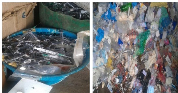
Fig. 1 Waste generated by facilities