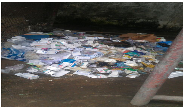
Fig. 3 On- site Storage at a facility