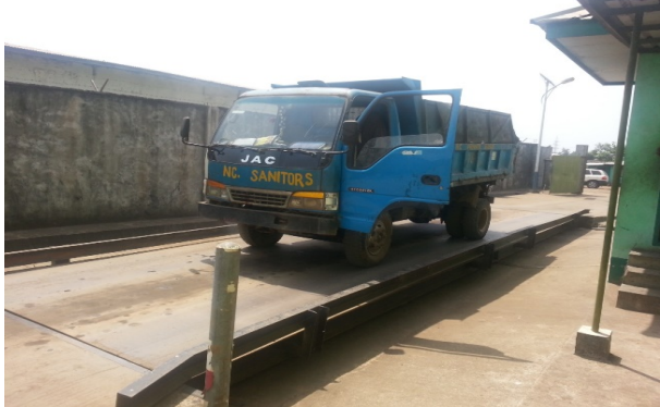
Fig. 5 Transportation of healthcare waste in Liberia