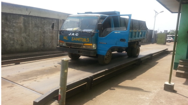
Fig. 5 Transportation of healthcare waste in Liberia