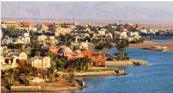
Fig. 4 Elgouna Resort [24]

This resort is located in Elgouna, 25 kilometers north of Hurghada city. El Gouna has two main hubs of activity. The first is the Abu Tig Marina and its new extension, the New Marina. The second is Downtown, which includes Kafr El Gouna and Tamr Henna. The resort is comprises a total land area of 36.9 million sqm. El Gouna boasts 16 hotels, for a total capacity of 2,707 rooms. The resort offers a wide range of international-standard facilities such as a landing strip, a European-standard hospital, a nursing institute, 18-hole championship golf course, three marinas, four international schools, child daycare facilities, a library linked to Bibliotheca Alexandrina, a branch of the American University in Cairo (AUC), and TUB Berlin University that opened in October 2012. Besides, it offers restaurants, bars, shops, cafés, spas, a football team and sporting club, certified diving centers, nurseries and as well as mosques and churches and one small museum , a private airport and various services [25].