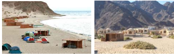
Fig. 10 Basata Resort [28]