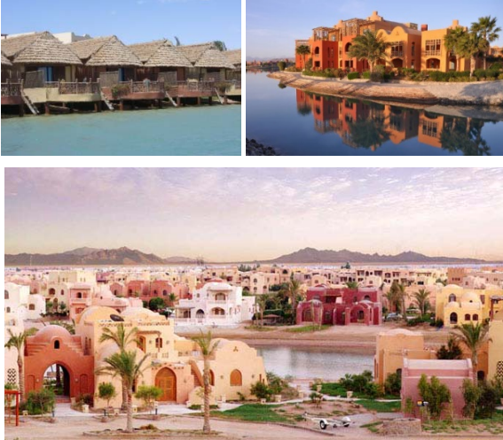
Fig. 8 Elgouna Resort [24]