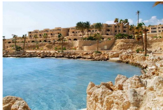
Fig. 3 Sahl Hasheesh Resort [22]

Sahl Hasheesh is a luxury resort located along red sea coast, 18 kilometers south of the city of Hurgada. It extends over an area about 8000 acres. The Master Plan for Sahl Hasheesh is designed to create a vibrant resort of lasting value, setting a new benchmark for sustainable development and 'resort style' living in Egypt. This vision and associated design guidelines are intended to guide the future development of Sahl Hasheesh, setting out a clear and responsive strategy in respect of land use, built form and urban design, open space, access and circulation, transportation, sustainability and infrastructure delivery.