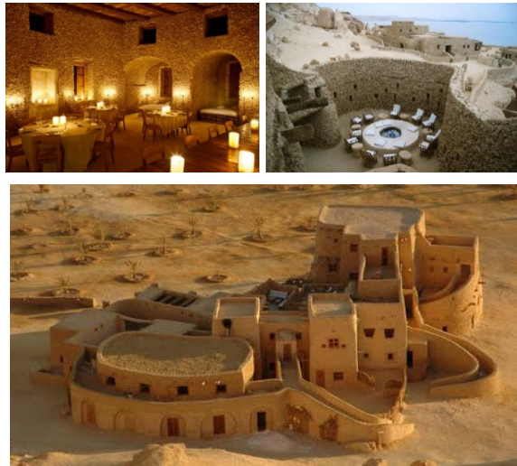
Fig. 9 Adrère Amellal Resort [26]

doors. In addition, local olive trees were used for making bars and frames of door and some tables.