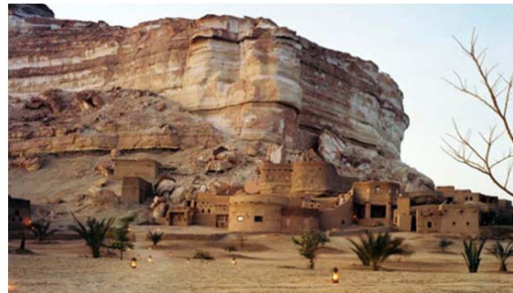
Fig. 5 Adrere Amellal Resort [26]

The resort is on a 60-hectare site at the foot of the Adrère Amellal Mountain, 18 kilometers from Siwa. It has been developed with the full cooperation of the local community. The Hotel Adrere Amellal is a luxurious eco lodge radically different from traditional luxury and it is designed by the architect Ramez Azmy. There's no electricity or telephone in these dwellings made of kershef, a mixture of earth, stone and salt water. The food comes exclusively from the hotel's organic garden. The building is a veritable labyrinth of corridors leading to terraces or sumptuous and elegant covered areas [27].