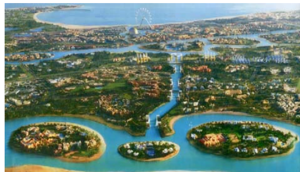
Fig. 7 Sahl Hasheesh Resort [22]