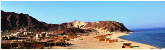
Fig. 6 Basata Resort [28]

Basata is the first unique eco-lodge built in Egypt in 1986. The resort is located in South Sinai between Taba and Nuweiba, possessing one of best five beaches in the world. Basata means “simplicity” in Arabic, which personifies the philosophy behind this environmentally conscious tourist project.