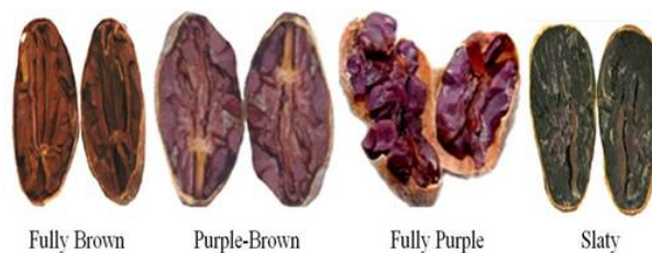
Fig. 2 Color of cut surface of dried cocoa beans