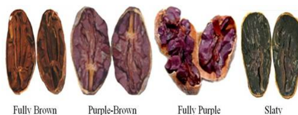
Fig. 2 Color of cut surface of dried cocoa beans