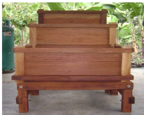
Fig. 1 Shallow box used in the experiment

Fermentation was carried out simultaneously in shallow box measuring 90 X 60 X 31 cm 3 for five days (Fig. 1) as described in [16] for all treatment. A total of 150 kg wet beans were loaded into each box and the mass was covered with gunny sack. The beans mass was turned at 72 hours by transferring from one box to another. Approximately 15 kg of fermented beans were taken randomly at the top, middle and the bottom layer of mass for duration of 0, 24, 48, 72, 96 and 120 hours fermentation, respectively. The beans were sun dried at one bean thickness on drying platform until the moisture content reduced to less than 7.5 per cent. Upon dry, each of samples were "quartered" down using quartering tools to approximately two kilogram each, labeled and stored in sealed container.