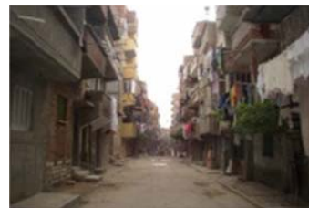
Fig. 3 Passages

Nevertheless, the layout of multifunctional vertices at the various graph levels is more integrated than the other of functional merge only at the deep 'inhabitant' domain. The isomorphic graphs of layouts '4 & 1' enforce the same observation with the less layout integrity of single function per room. However, the graphs of layouts '3 & 20' have a fewer number of deep vertices with a higher spatial integrity. Thus, the deepest graph level of more vertices with single functions causes the less integration of layout. Another phenomenon observes the more layout integration of direct access between the 'visitor' and 'inhabitant' domains, while the insertion of access corridor between them causes the decrease of spatial integrity. Meanwhile, the first two layouts of integral range split their utility rooms apart from each other, while the further three layouts set the 'toilet' inside the 'kitchen' depth.