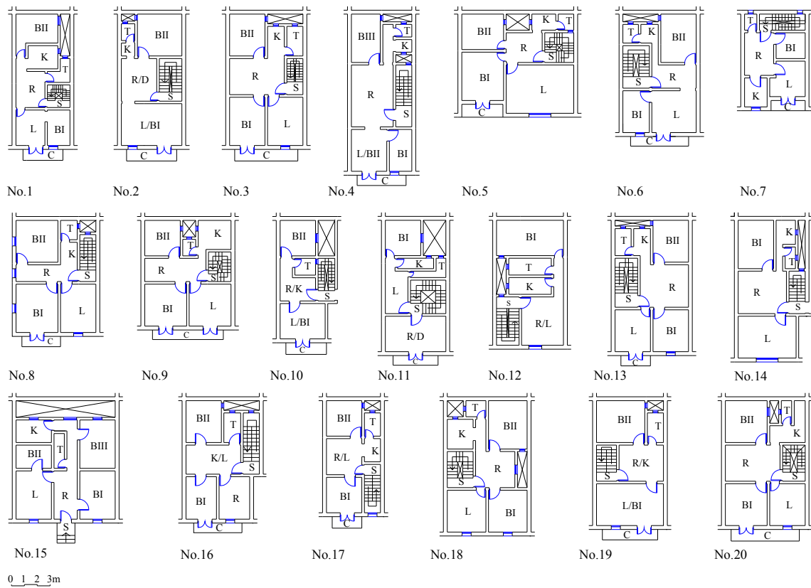
Fig. 7 Typical floor plans of survey buildings in 2015