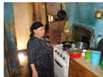
Fig. 6 Interiors