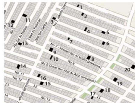
Fig. 2 Location of sample buildings