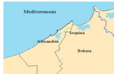
Fig. 1 Location of 'Sequina' slum area

of space converts the building rooms into topological graph representation, which interprets spatial measurements with graph algorithms [9]. Meanwhile, the spatial visibility enriches the space syntax of housing decodes [7]. This specific study focuses on the integral measure of rooms according to the analytical criteria of: 1) real relative asymmetry (RRA) of collective layouts, 2) relative asymmetry (RA) of individual layouts, and 3) spatial visibility in layouts. The correlation of these issues clarifies the social logic of spatial structure at different levels of integral resolutions. The prospected social overview adjusts the long-term comprehensive plan strategy of redeveloping slum areas for a better future of Alexandria [1].