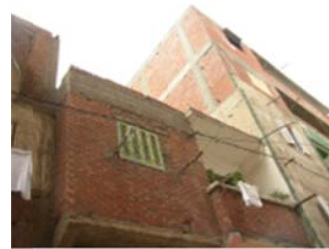
Fig. 4 Heights