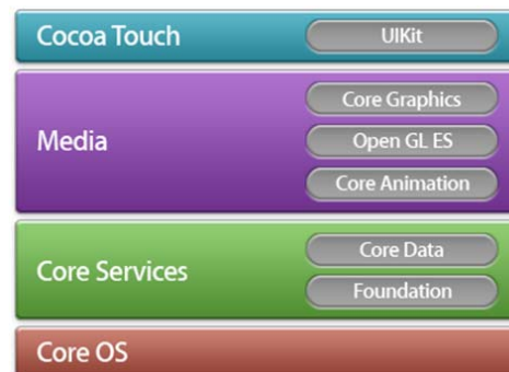
Fig. 2 iOS Framework

The main approach of the iOS Framework is to give an opportunity to clearly and easily create iOS & Android apps with HTML, CSS, and JavaScript. It offers ways of possible solutions somehow. However, it is not compatible with all platforms. It is focused merely on iOS and Google Material design that brings the best experience and easy to use. It is shown in Fig. 2.