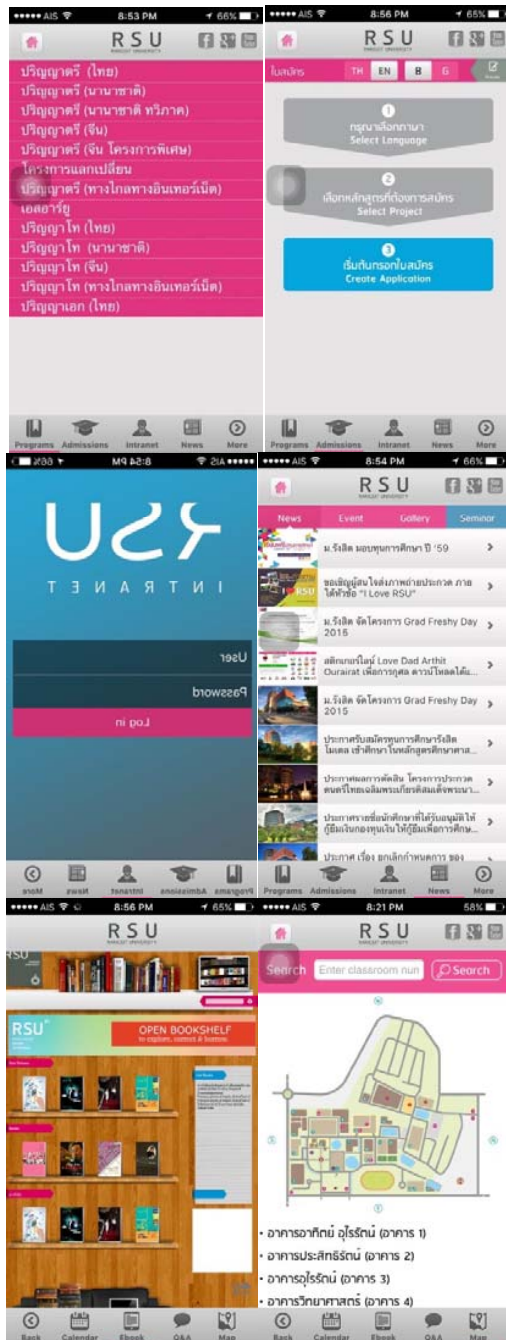
Fig. 3 Iteration Screens

From the satisfaction survey, on the 2 nd topic, which contains the details about the various aspects of the RSU app. [3]-[5] is the level of performance and quality (Rating Scale). The results of the survey terms of installation process and an understanding of the app use are given the highest satisfaction level or 5. These results suggest that end users can learn and quickly use the app, the average score is 4.82 SD 0.53. The installation applications process and the applications are all easy and affordable to execute, with an average score of 4.74