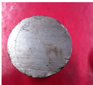
Fig. 1 The casting [14]