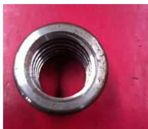
Fig. 2 The skin [14]