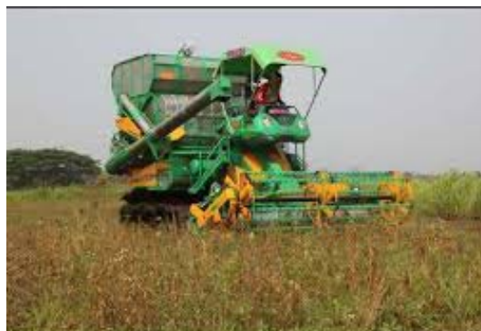
Fig. 5 Versatile tool of peasant harvesters [14]