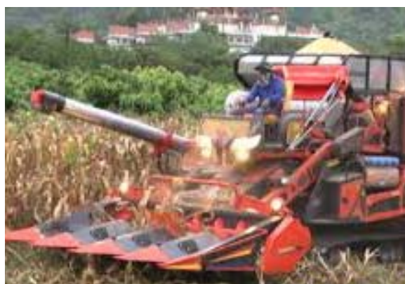
Fig. 7 Hook served with rice padding seeds from the crops [14]

When compared, the problems on basic factors in running the business in Table II, it was found that there was no statistically difference at .05 in managing of the small and medium size agricultural machinery manufacturers. However, there was a statistically significant difference between the small and medium size agricultural machinery manufacturers on the aspect of policy and services of the government. The problems reported by the small and medium size agricultural machinery manufacturers were the services on public tap water and the problem on politic and stability of the country [5], [15]-[32].