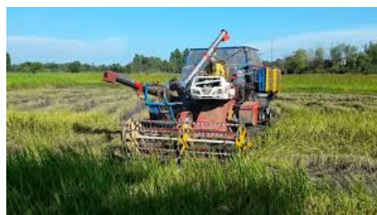
Fig. 6 Rice paddies [14]