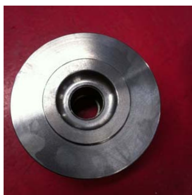
Fig. 4 Prepared casting with the skin [14]