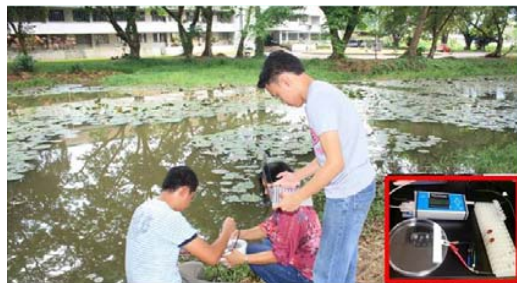
Fig. 3 On-site sampling and analysis of mosquito larvae using fabricated nanobiosensor for dengue virus detection. Inset . Prototype of the fabricated dengue virus nanobiosensor with the handheld potentiostat

dengue virus in natural Aedes populations prior to dengue outbreak particularly in developing countries. The research team has continuing experiments on mosquito samples collected from stagnant waters in rural communities in the Philippines (Fig. 3).