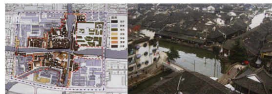
Fig. 9 The planning and scene of Keqiao

Keqiao located in Shaoxing, a typical southern land of plenty, in the heart of the town is the eastern Zhejiang canal, Ke river, with the other two streets divide the block into four parts, at the intersection of three waterways used a stone bridges to connect these parts. In the process of totally planning and transformation, designers pay a lot attention on the water and street parallel spatial structure; they regard the public space and the station gate node as the "point", several water and streets as the "line" and the core area of the Four Rivers Bridge as the "surface", constituting point line combination. The building and bridge, the river spatial scale, the shape riparian and waterways, forms Hebu head and so on are regarded as composition and taken into consideration, and following this concept, by combining water system, the quality, time and style of construction to divide the planning land into protection zone and Traditional style coordination area, take appropriate measures to protect and remediation (Fig. 9). These two parts harmoniously accommodate with each other and show the Water Features [7].