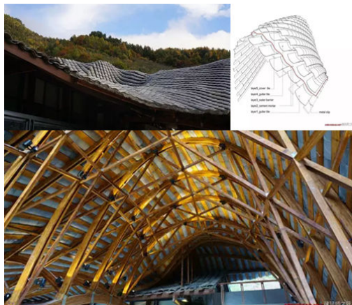
Fig. 8 The roof of volunteers' house of Cattle Hill

The second one is psychological experience. Mental state is valid clues to stimulate memories. In the process of feeling the surrounding environment and producing comprehensive experience, human emotion will produce a corresponding change and the psychological feelings will be stored as well as memory instinctively. The form of this memory needs a long time and repetitive affection. Once formed, it will be very profound, even if the original scene has been changed totally, the brain also can retrieval cue, stimulate memory and mobilize the emotions, then the sense of belonging to the new environment will be created. Through the perceptual function, space and detail, people can always achieve the effect of stimulate the memory by psychological experience. Make the transform of the ancient villages of southern China as an example. The geographical features of these villages lead to a unique life style which reflected in the transportation, housing, clothing, diet and so on. Most of these towns were built by the water, agricultural activities and transport rely most on boats and water. They have parallel spatial structure consisted of water and street. The courtyard is the basic unit of streets and lanes, locals regard river system as order and bridges as link, forming the water door pillow residential features and bridges people Village Scene. These water features as a way of life and an integral part of the residents has become a deep memory.