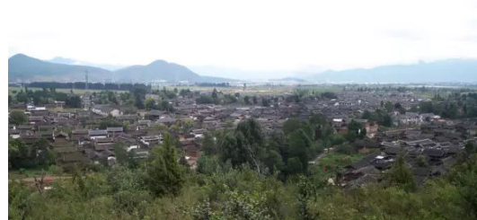
Fig. 5 The old and new part of Suhe village

wall, tile and other elements to make the old and new villages can be docked in appearance (Fig. 5), new functions are added in the interior to enhance the quality of residents' life, which embodies the principle that save the building exterior and keep the renewal and transformation of the interior space (Fig. 6).