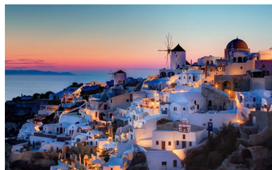
Fig. 3 Santorini Island

"Landscape" elements often with emotion linked relates to people's feelings, involving the objective environment and experiences, not only contains all natural landscape, artificial landscape, also contained man and other animals in these landscapes, such as common rural building on the top of slope, the ridge segmentation of large field, busy farming season, cluster chickens under the tree, dog running on the trail (Fig. 4), all of these are elements of village, when the brain receives the information, it is easy to contact concept and drive out the concept of country.