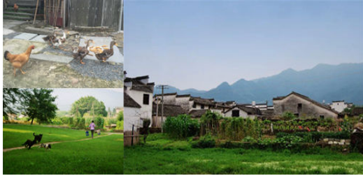
Fig. 4 Nanping village