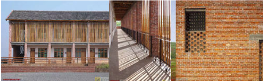
Fig. 7 Zheshang Hope Primary School

The building also constituted by some local materials, but the shape of the tile roof using the parametric design is a distinguishing feature. The old buildings were re-covered and interact with clouds and mountains. In this building, the new technology and the appearance and construction methods of the traditional rural architecture were combined together (Fig. 8). The parameterized was realized by traditional techniques.