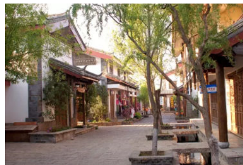
Fig. 6 The new street of Suhe village