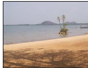
Fig. 2 Lagoa da Confusão

and flora of the cerrado vegetation and the Amazon rainforest. The main tourist attraction of the city is the lagoon (see Fig. 2), with 4.5 km in diameter, maximum depth of 3 meters, a diverse vegetation and marshy formations, surrounded by shallow waters and fine sandy beaches. It features a large rock (see Fig. 3), as mentioned previously, catches visitors' attention and curiosity.