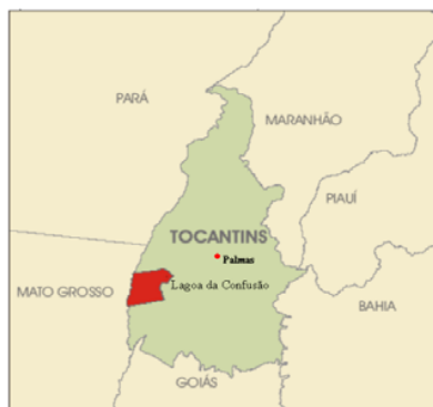
Fig. 1 Lagoa da Confusão location map

The territory of the municipality has an area of 10,564.661 km 2 and 11.859 inhabitants. It is situated in the western region of the State of Tocantins, Brazil, at the geographical coordinates 10°47'37"S latitude and 49°37'25"W longitude, on the right bank of the Araguaia River. The city is 184 km from the State capital of Palmas [7].