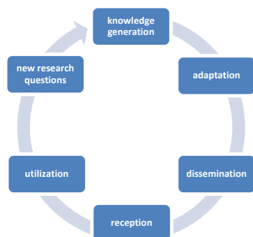
Fig. 2 Preliminary knowledge transfer model in applied translation

Hence, while the transfer of new knowledge into practice proceeds through three stages, from awareness through acceptance to adoption, applied translation research focuses almost exclusively on the first two stages. Reference [22] claims that the process of knowledge transfer is not a mere transfer of knowledge per se; it rather requires an additional type of knowledge, namely 'the knowledge about how to transfer knowledge'. Translation practitioners are hardly interested in researchers telling them simply "this is what I think", but they would like to hear them say "this is what my knowledge means for you, and this is how it applies to your daily business". Further, the purpose of knowledge transfer may very well be lost if knowledge is transferred from the source (theoretician) to the receiver (practitioner) without contextualizing the way it will be utilized by the latter. In the absence of a clearly defined cycle of knowledge transfer in translation, the misconceptions above on technical translation would be hard to shake off. A schematic representation of the suggested model of knowledge transfer in applied translation in general and technical translation in particular is given below [18]-[23]: