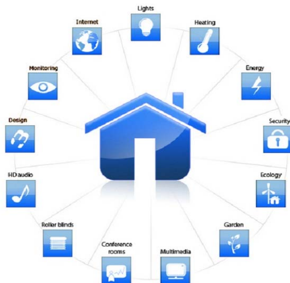
Fig. 1 Display of Typical Home Systems

This paper proposes the development of the interface ConductHome meant to simplify the interaction with a home automation environment.