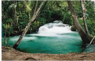
Fig. 3 Cachoeira do Formiga