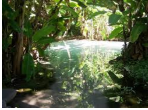
Fig. 2 Fervedouro