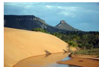
Fig. 1 Dunas

The place offers attractions such as dunes, springs called “fervedouro”, waterfalls and rivers, which provide ecotourism, and has been explored in a disorderly way (see Figs. 1-4).