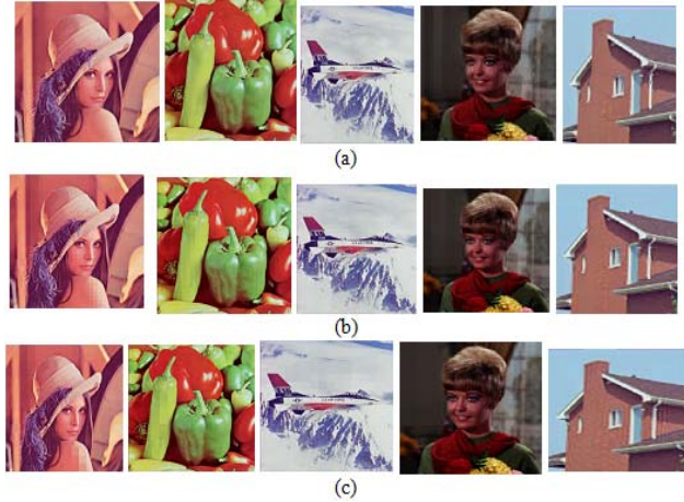
Fig. 5 Compressed images visual performance of the proposed method (A-3): a) DCT block size is 8 \times 8 , b) DCT block size is 16 \times 16 and c) DCT block size is 32 \times 32