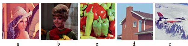
Fig. 2 Original test images: (a) Lena, (b) Zelda, (c) Fruit, (d) House and (e) Airplane

From the results listed in Table I, the proposed codec achieves a high performance, and we can conclude that about 0.1299-0.3404-bit rate reduction on average is achievable by using the proposed method (A-3). The subjective visual quality is compared using a different color image, as shown in Figs. 3, 4, 5, respectively. Figs. 3 (c), 4 (c), and 5 (c) show less block artifact than resulted image by A-3 with block size 8x8 in Figs. 3 (a), 4 (a), and 5 (a).