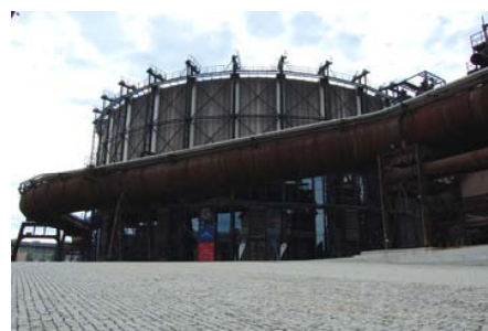
Fig. 6 Gasometer Gong

Gasholder has become a convention center, which seats up to 1500 seats, gallery, restaurant, lounge and locker rooms. In order to achieve this final form, it was necessary to use special construction technology. After the production of the gas tank is empty, the bell remained at a height of one and a half meters inside the entrance featured a hole burned in the mantle of size two times three meters.