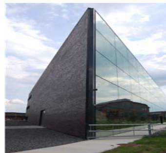
Fig. 2 The corner of The World of Technology