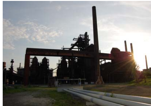
Fig. 1 Vítkovice area

Vítkovice area for the possibility of drawing funds from ministry of culture Integrated Operating Programme and also therefore in the same year there was made a nonprofit organization called Association of Lower Vítkovice area legal entities.