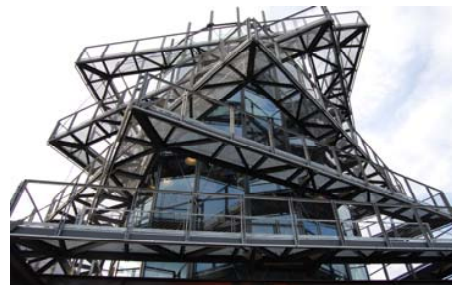
Fig. 5 Extension of the blast furnace

bridge was installed four-ton skip hoist with authentic propulsion engine. The car is in the top glass clear glass and the bottom glass black and is able to take up to sixteen persons. The tower is sixty meters high, allows a unique view of the Lower Vitkovice, and the panorama of Ostrava.