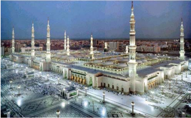
Fig. 1 The feature of Al-Nabi Mosque as the first Islamic construction

to the particular function of the mosque (being a place for worshipping God) but also due what has been mentioned in Koran [13] which has identified a strong and sacred link between architecture and mosque thus making mosque architecture one of the oldest works of Moslems.