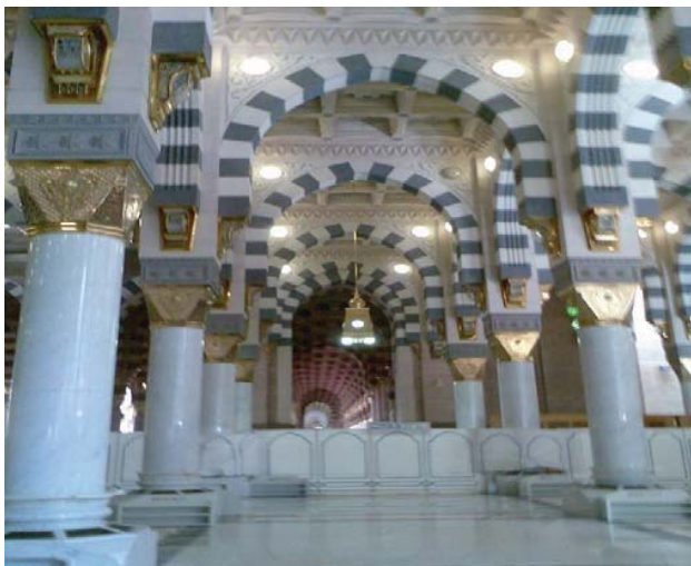
Fig. 2 The internal feature of Al-Nabi Mosque

We should make it clear that Islamic architecture had originated and then its features were inferred accordingly. However, the religious aspect is the most distinctive feature to which Islamic architecture is indebted. It is represented in the Islamic aesthetic mentality.