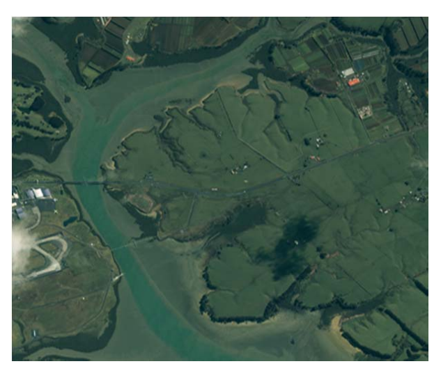
Fig. 3 Original geospatial image (Image is taken from Sample Imagery List of GeoEye Inc. (formerly Orbital Imaging Corporation or ORBIMAGE) which is an American commercial satellite imagery company

From Table III, it is clear that pixel level parallelism is more efficient than its sequential counterpart. Image is taken from Sample Imagery List of GeoEye Inc. (formerly Orbital Imaging Corporation or ORBIMAGE) which is an American commercial satellite imagery company. The original image is depicted in Fig. 3. The edge detected image is depicted in Fig. 4