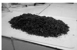
Fig. 2 The powder of sage

The harvested leaves are dried in the shade for a week in a dry and ventilated place, then ground using a grinder. The powder is placed in airtight jars and stored dry (room temperature) and to protect from moisture (Fig. 2).