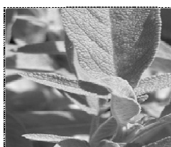
Fig. 1 Sage leaves

Sage likes dry soils with good calcium intake, located in hot, sunny and protected from the wind. Indeed, sage is grown from seed in spring. The leaves are harvested in the summer [10].