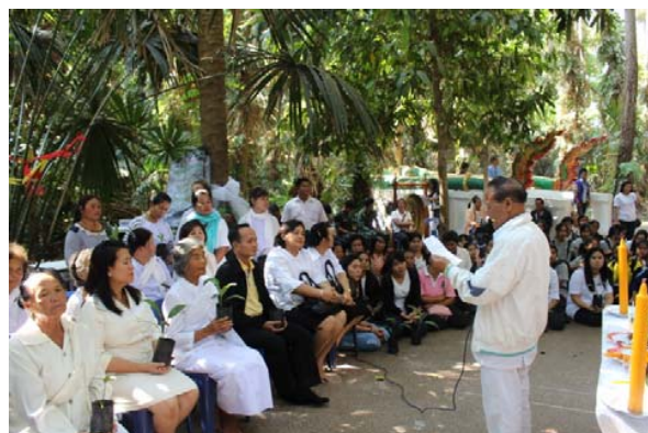
Fig. 7 People participated Taraw Palm Trees Planting in Pa Kamchanoad