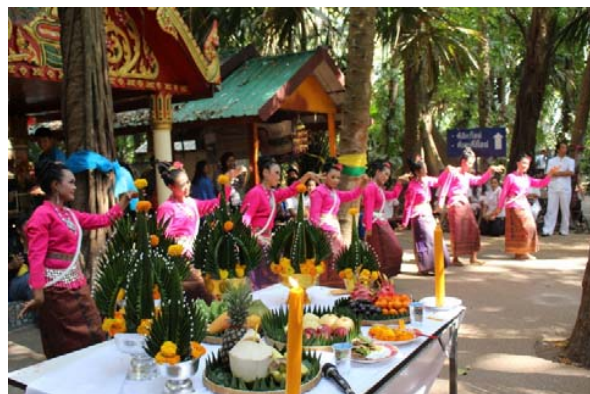
Fig. 6 Blessing Ceremony before Taraw Palm Trees Planting in Pa Kamchanoad

linked to the local community. This is congruent with sustainable tourism management principles; specifically simultaneous tourism development and environmental development by correctly and appropriately utilizing natural benefits through education and creative planning for the longest-lasting and greatest common benefit. At the same time, the environment must be preserved or ensured the least possible damage [4]. The management and development of Pa Kamchanoad as a tourist site has been planned in two phases: the current management and development and future management and development. This is consistent with the issue raised by [5] regarding the immediate need for development of basic infrastructure for tourism, namely restrooms and shower rooms, parking lots and tourist information centres. This also agrees with [6] in the matter of eco-tourism urgently needing signage at tourist sites, as well as public relations brochures and periodicals to introduce tourist sites. Full community participation should be genuinely encouraged and supported, corresponding to [7], [8] who found that the majority of citizens have mid-level overall participation in tourism management. Accordingly, in the development of sustainable tourism, it is imperative to hasten support for the community to fully participate.