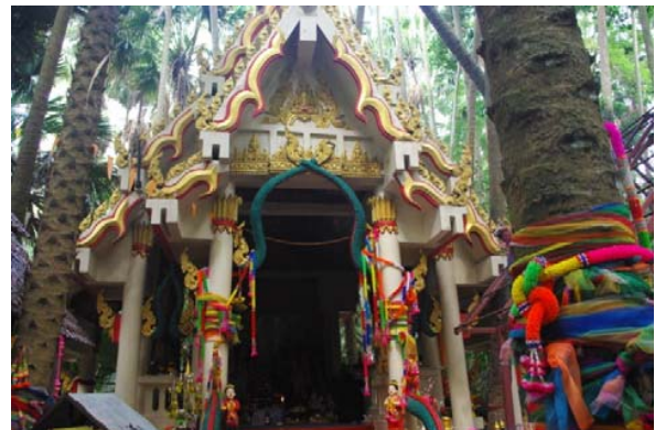
Fig. 3 Centre Shrine in Pa Kamchanoad