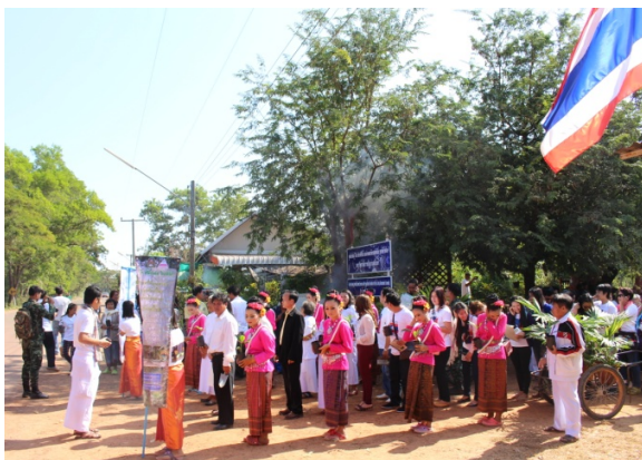
Fig. 5 Taraw Palm Trees Planting Ceremony