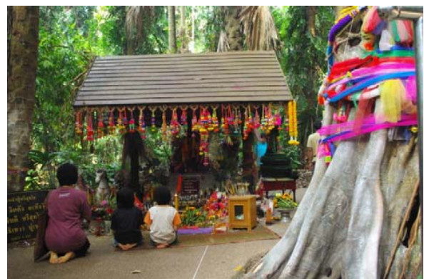
Fig. 4 Small Shrine in Pa Kamchanoad

The guidelines for the development of Pa Kamchanoad as a tourism site grew from the cooperation of many sectors; government agencies, local administrative organizations and the general public in the vicinity. The management and