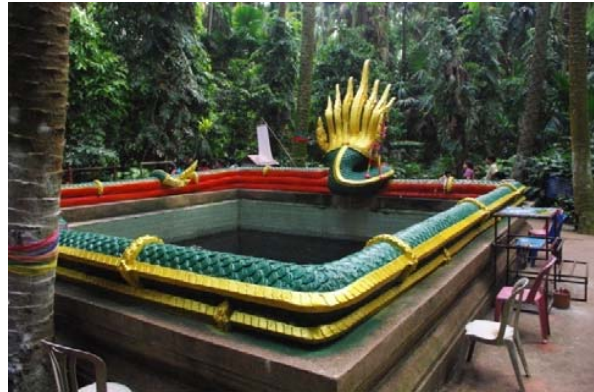
Fig. 2 Pa Kamchanoad

Thani Province. A working team was appointed to study and find ways to solve the problem of the deterioration of Pa Kamchanoad with the intention to restore the eco system of Pa Kamchanoad to its former abundance, establish a sacred tourism site in Udon Thani, and also to help create jobs and income for the locals [2].