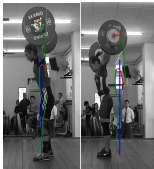
(a) Outstanding lifter (b) General lifter

In Fig. 4, we can obtain that the biggest difference between the two athletes is the barbell trajectory in the turnover phase to the catch phase. Although these two lifting are successful, however, the general lifter presents a larger shift rearward. In the catching phase, the outstanding lifter keeps the falling distance of the barbell shorter than the general lifter does, which reduces the time of the trunk supporting the whole barbell weight and shorten the time to complete the movement.