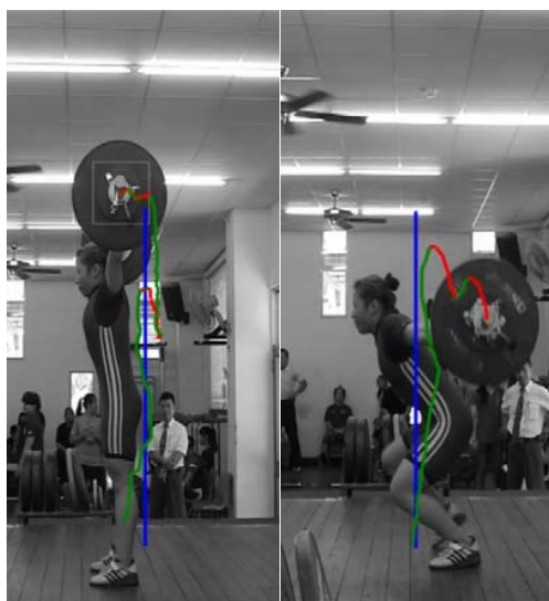
(a) success (b) failure