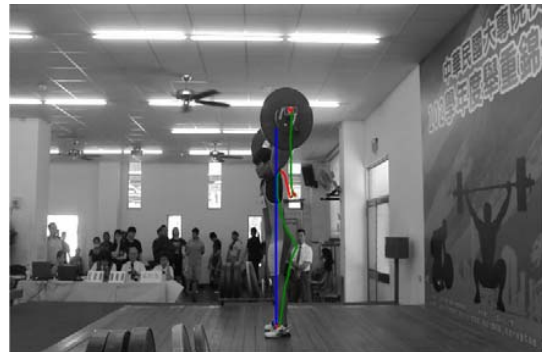
Fig. 1 Self-developed computer aided weightlifting training system with barbell trajectory

women's group 53-kilogramme class snatch action as an example. The competition was held in Gushan High School on 24th to 25th of May, 2014 in Kaohsiung, Taiwan, R.O.C. It was an open and public competition, and could be recording. We utilize a general consumer digital camera with a tripod to record videos. The camera position was set on the broadside of the lifters. The height and the position of the camera and tripod are fixed during the process. The focal length of camera is also fixed to record all of the trunk and side action of the lifters. We utilized a self-developed computer aided weightlifting training system to gather the barbell trajectory automatically and evaluate the performance of the lifter.