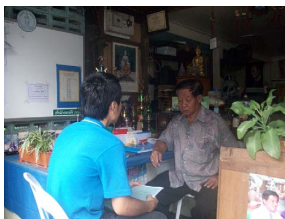
Fig. 7 Community Leader Interview

In regard to the working parents, they do not have time to teach their children the social etiquette or to give them a well-defined schedule that includes coming home at a certain time. As a result, children spend most of their time outside the house, socializing with friends (school, internet cafe, department store etc.) [5]. In conclusion, the combinations of these realities are eroding traditional Thai culture and they may be completely gone within one generation.