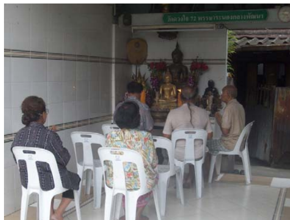
Fig. 6 Community of Committee Participation Meeting

Most people in the community are Buddhist and there is local temple called "Wat Duangjai 72 Pansa" that lacks a monk to perform religious functions and, as a result, if the members of the community want a small religious function, they need to invite a monk to perform activities. However, if it is a large religious function or particularly important day in the Buddhist calendar, they will make a trip to the nearby temple. [4]