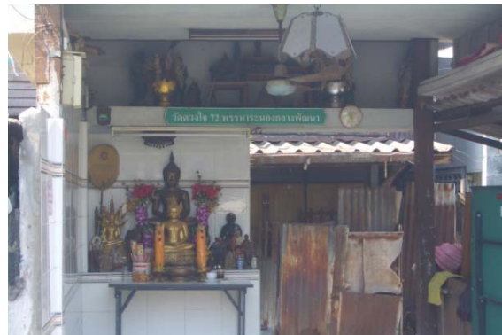
Fig. 3 The community temple Ranonkhang 72

The way of life goes according to all forms of modern city life. The appearance of a new lifestyle that reflects the lifestyle of different people are clearly increasing more and more every day.