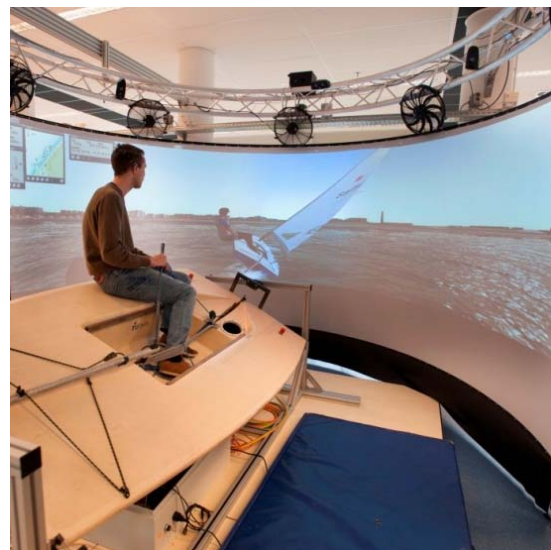
Fig. 9 InnoSportLab’s Yacht Simulator

InnoSportLab’s virtual reality software tracks a vast range of physical responses to such things as rudder pressure, trimming actions and sheet tensions. Performance data can be read in real time. The simulator also stores complete race records that can be re-run later. The sail simulator is a product of Stentec Software BV and Delft University of Technology. The center runs several other hi-tech research projects in service of Dutch