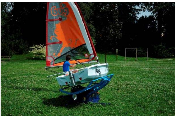
Fig. 6 Sailing Maker’s Yacht Simulator

The stable, solid, safe cradle ensures great adaptability for housing all classic sailboats: Optimist, Laser, RS, Equipe etc. Easily and quickly assembled without the need for special tools and entirely realised in painted steel to prevent corrosion from water and humidity over time. Four castor wheels make SAILING MAKER particularly safe and easy to manoeuvre, even with a full load. An industrial, low absorption fan positioned in front of the cradle modulates the right amount of air to create the best conditions for practising manoeuvres before attempting to do so on the water. Fig. 6 shows sailing maker’s yacht simulator [8].