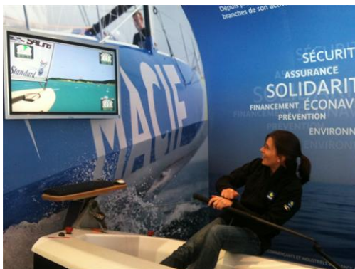
Fig. 2 VS-C1's Yacht Simulator