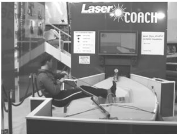
Fig. 7 Laser Coach’s Yacht Simulator

The user receives feedback from the visual representation of where the dinghy is relative to the wind and course, as well as feedback from the simulator in the form of rudder forces, mainsheet tension, heel moment and angle. It is then up to the user to balance these forces and moments.