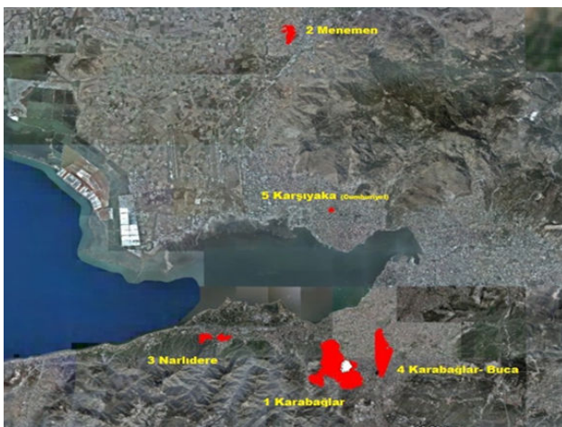
Fig. 2 At-risk areas determined by the İzmir Directorate of Infrastructure and Urban Transformation [11]

Also, through recently arrangements, the central government has become as efficient as local governments. In addition to the existing authorization of the Mass Housing Administration, the Ministry of Environment and Urban Planning is also authorized and in charge at various stages, from the approval of plans to their implementation. Based on statements made, it has been acknowledged that İzmir is among the pilot cities where urban transformation implementations will be initiated by the central government. The establishment of Directorates of Infrastructure and Urban Transformation in the Bursa, İstanbul, and İzmir provinces as field services of the Ministry of Environment and Urban Planning affiliated directly with the center has been resolved upon based on the Cabinet Decree dated August 13, 2012, which was proclaimed in the official gazette and took effect in September.