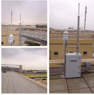
Fig. 2 The second monitoring station installed at a background location at the north from the first station

Emissions of each source are apportioned into a series of particle size classes, where a gravitational settling velocity and a deposition velocity are computed by the model for each class. The pollutant transport is governed by the general atmospheric advection-diffusion equation. After a number of simplifying assumptions, the equation for the concentration becomes [16]: