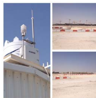
Fig. 1 The first Monitoring Station installed at a rested construction site

Two monitoring stations were used for this study. One station was installed at a rested (i.e. not active during the study) construction site located at Qatar Foundation Education City within the city of Doha, Qatar. This site was chosen as it represents an open bare land, highly susceptible to wind activity and close to an educational campus & residential areas (Fig. 1). The second station was placed at a building roof top 1.5 \text{ km} away NE (38 degrees heading) from the first station to measure background PM concentrations (Fig. 2). PM emissions rates were monitored for a period of 9 days (from 30th April to 8th May 2014). Meteorological data such as wind speed, wind direction, temperature and humidity were also measured through a climate sensor attached on the top of the station.