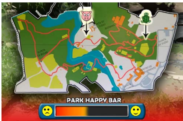
Fig. 1 Park Heros, game map, screenshot iPad

PhoneGap (Cordova) is a framework that allows programmers to build applications for mobile phones and tablets. Although PhoneGap is theoretically a multiplatform [8] framework, the students were asked to focus on preparing a prototype of the game that would work on Android mobile devices.