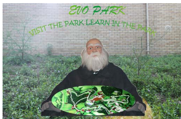
Fig. 2 Evo Park, main screen, screenshot iPad

During the WalkAbout Porto 2013 project, student programmers took part in workshops about GGULIVRR framework (see Figs. 1-3).