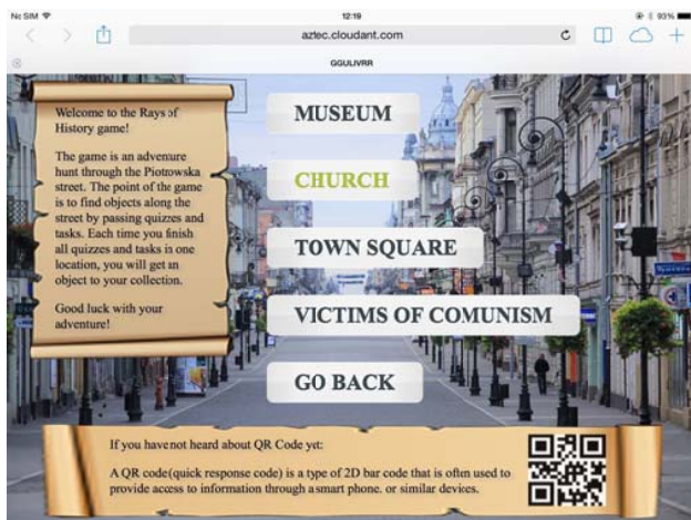
Fig. 8 Rays of History, screenshot from iPad

The mentors usually finished their formal meetings with their teams in the late afternoon. However, in both Porto and Lodz, it became common for the students to seek an additional meeting with their mentors in the evening time. These