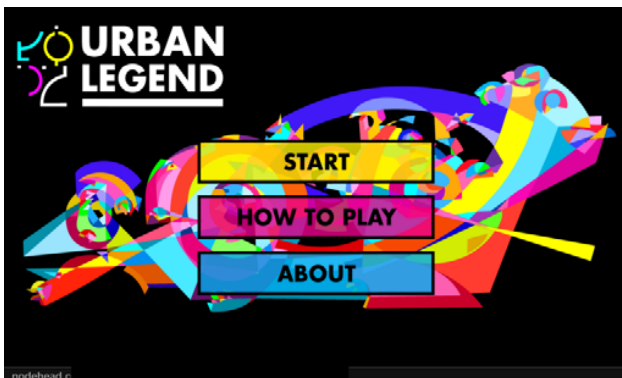
Fig. 4 Urban Legend, main screen, screenshot from BlackBerry Z10Ltd

Secondly, at the final presentation, students focused strongly on their prototype games. One team managed to prepare an application that consisted of several small and simple mini-games and the other four teams showed one to three screens of their games that were fully playable.