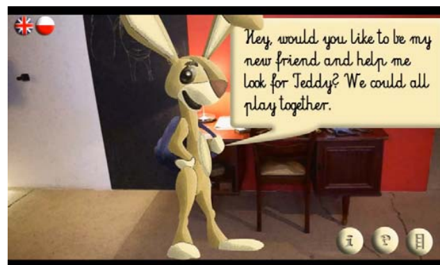
Fig. 6 Game of dolls, screenshot from BB Z10Ltd

In both Porto and Lodz, students used the Agile software development methodology [9].