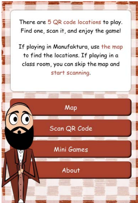
Fig. 7 Weavers game, screenshot from Samsung Galaxy S3

leaders. These meetings had a great impact on the teams. It gave the students a chance to share their experience and to appreciate their creative and business strengths as being of the same importance as the work being done by the technical students.