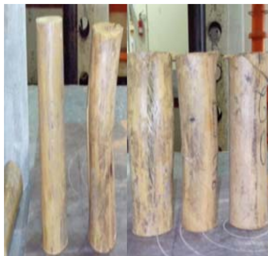
Fig. 4 Mixed modes of failure observed in samples