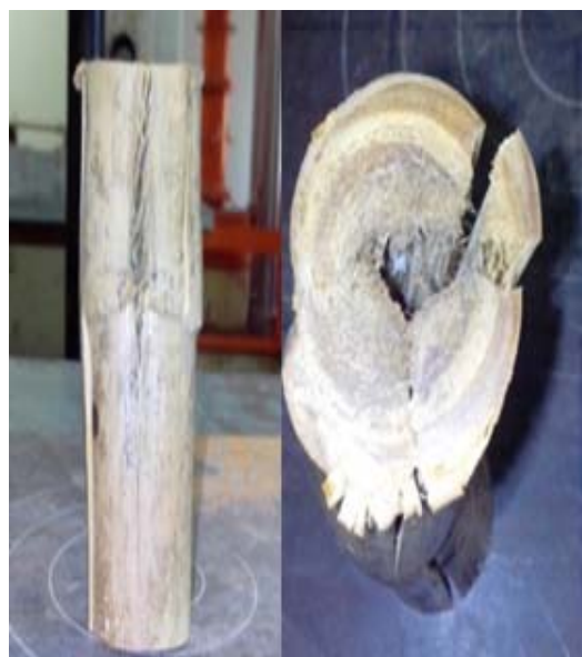
Fig. 3 Cracking and splitting mode of failure

From structural engineering point of view, treated bamboo culm possesses competitive strength characteristics, comparable to concrete and steel.