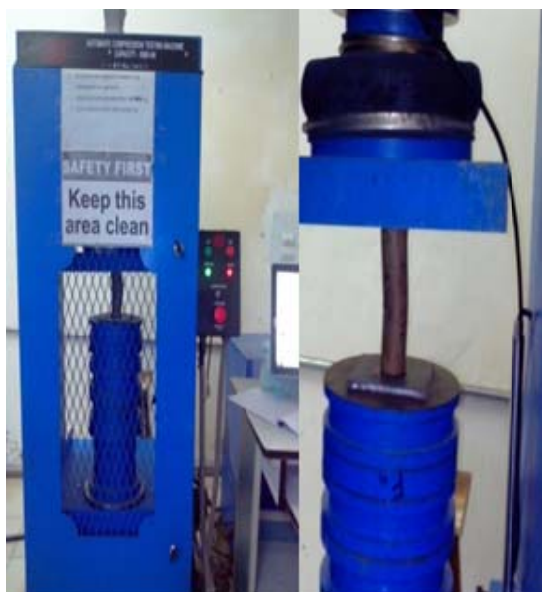
Fig. 1 HEICO Automatic compression testing machine

Different modes of failure were observed in both control and eco-friendly treated bamboo samples. There was no particular mode of failure observed for both type of samples.