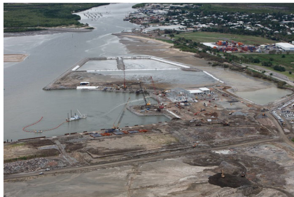
Fig. 3 Small size CSD dredging TMP mooring -2011

Though it has long straight geometry, Ross River channel has a shallow depth of 3 m that not accessible by the large size TSHD 'Brisbane', thus only accessible by small size TSHD. As there is no small size TSHD available in the eastern coast of Australia, the Port of Townsville hires services of small size cutter suction dredge (CSD) on as required basis for Ross River and Townsville Marine Precinct mooring area dredging. The maintenance dredging material derived from Ross River area is pumped into containment ponds at port's eastern reclamation area through submerged, floating and land base pipe line. In addition to the grab dredge, TSHD, and small size CSD vessels, the port regularly uses drag beam 'bed leveller' to agitate silt build-up and drag silt into storage areas as well as removal of high spots that left by the TSHD.