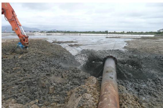
Fig. 4 Dredged material placement into port's ERA - 2011

One of the predominant aims of the 1996 Protocol is to have less and cleaner waste disposed at sea. This aim falls in line with Port of Townsville's strategy of reduction of the amount of dredge material to be disposed at sea and maximizing land reclamation alternative [5]. The current port's land based maintenance dredging material disposal is regulated by Queensland Environmental Protection Agency (EPA). EPA issues permit that outlines the maintenance dredging locations, depths, dredge plant to be utilised, quantities of material to be dredged and disposal locations. The option to have dredge material pumped ashore for land reclamation is created by the lack of land to satisfy the port infrastructure requirements and the need to handle contaminated dredged materials.