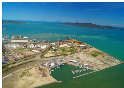
Fig. 5 Port of Townsville Eastern Reclamation Area -2014

Townsville's infrastructure ,Townsville Marine Precinct and the sea channel section of Ross River.