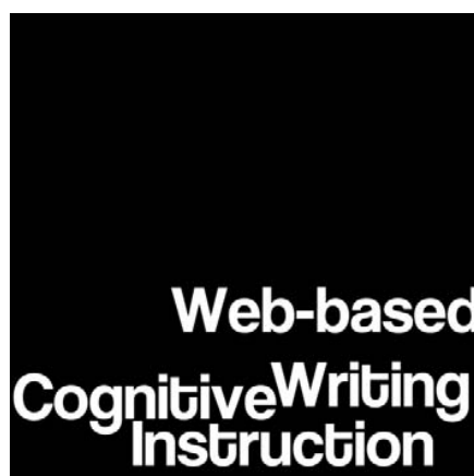
Fig. 1 The official logo of Web-based Cognitive Writing Instruction (WeCWI)

environment can produce learning on par with that of traditional courses, however students can have much more control over their own learning with online instruction.” In addition, [13] also highlights that “e-Learning can be a great fit for all types of learners if you go about it in the right way.” WeCWI advocates the use of one of the most versatile Web 2.0 applications, blog, as an instructional tool together with the highly resourceful Web widgets and hypertext. With the use of the Internet, WeCWI encourages the educators to equip themselves with the knowledge and skills of using the blog to engage their learners towards language and cognitive developments, which can be fostered within a community of inquiry via CMC.