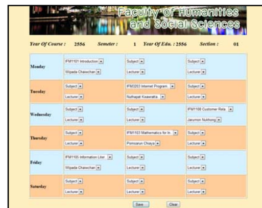
Fig. 4 Timetable management system Users are instructor can set and manage timetable by themselves