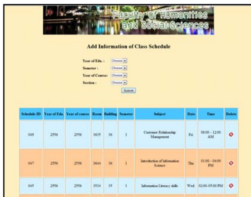
Fig. 2 Timetable Management System Details of the timetable by selecting the data to match with user requirements

The development of the online class scheduling management system by Webbased Application develops program using PHP language and database system using MySQL in the working process of the application of this system can provide several instructors to schedule simultaneously. Therefore, instructors can manage timetable by themselves, and check their timetable with searching and students can check and also publish a timetable and download other documents associated with the system immediately online. To fix the timetable, it is complicated and must be considered several factors depending on conditions and the number of courses. This also depends on the physical characteristics of each class. It will be much easier to change from manual to online one. New technology allows all users to save more time and ease their lives.