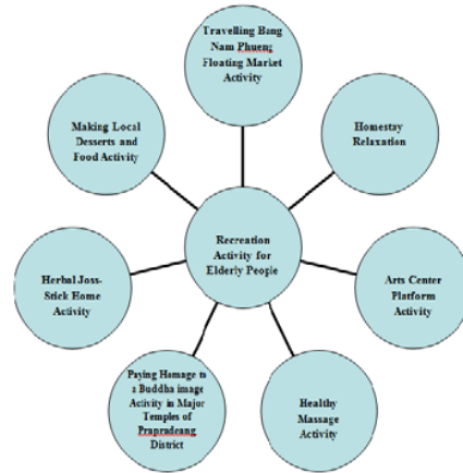
Fig. 2 The Healthy Recreation Activities for Elderly Tourists in 7 Groups

According to the research, the researcher found that the healthy recreation activities for elderly tourists could be divided in 7 groups as in Fig. 2.