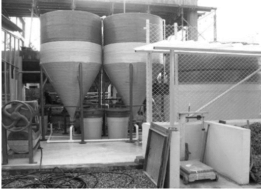
Fig. 1 Raw wastewater treatment plant