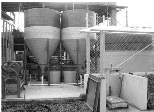
Fig. 1 Raw wastewater treatment plant