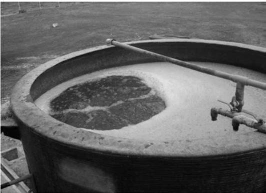
Fig. 2 Raw wastewater treatment tank