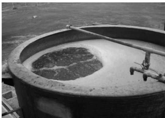
Fig. 2 Raw wastewater treatment tank